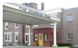
41 Pleasant St Auburn • 207-783-0961

THE CHAPMAN HOUSE is a 30-bed assisted living facility dedicated to providing the highest level of service and support for senior women age 65 and better. Residents enjoy the independence they desire and the health support they need. The staff is carefully selected and trained to monitor each resident and their Well-being, both physical and mental.