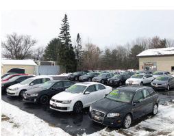
459 Washington Ave Auburn • 207-878-9088

In the LA area, consumers are very fortunate in having a used car dealer like RENNER PERFORMANCE . This used car dealership & service center has exclusively only been working on VW & Audi automobiles for over 25 years. The community-minded dealership basis its success of selling hundreds of vehicles on a simple fact of good business -- keep the customers satisfied! Check out their Facebook / Google reviews!!