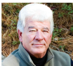
465 Main St, #201 Lewiston • 207-784-1575