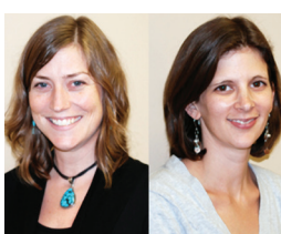
871 Court St Auburn • 207-376-4981

CORNERSTONE WELLNESS CENTER is a full-service Health and Wellness facility in Auburn featuring Counseling, Physical Therapy, Acupuncture, Massage Therapy, Health Coaching, & Movement Therapy/ Fitness Services.