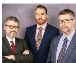
473 Center St Auburn • 207-344-9362