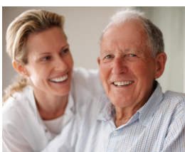
26 Bolster St Auburn • 207-784-1364

BOLSTER HEIGHTS RESIDENTIAL CARE is an 84-bed assisted living facility, nestled comfortably in quiet New Auburn. Purchased more than three decades ago by CMMC, Bolster now serves the greater Androscoggin community as a Level 4 Residential Care Facility.