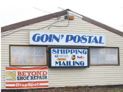
9 North River Rd Auburn • 207-784-9900

If you need something shipped or mailed in the LA area, GOIN' POSTAL is your one-stop solution. No need to go all over town to price check-- Goin' Postal offers complete services by all four major shippers: UPS, FedEx, USPS & DHL. They offer personalized packing services too, so if you've got to ship something awkward, bring it to them! They have a large variety of box sizes and packing materials to make it easy. Goin' Postal offers a vast array of services from expert custom packaging to worldwide shipping. They ship ALMOST everything, including art, antiques, electronics & computers, furniture and estate shipping. Every package is tracked electronically and transit insurance is available even for high-value items.