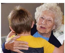
477 High St South Paris • 207-743-6300

MAINE VETERANS' HOMES IN SOUTH PARIS is all about community. Set on 11 acres with scenic wildlife and mountainous views, the community has a country charm and small town feel where residents and employees know one another by name. Their focus is on providing excellent senior care, comfort and camaraderie for the veterans who call South Paris home.