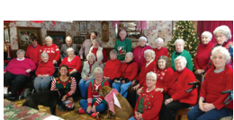
433 Rt 202 Greene • 207-946-3007

THE MEADOWS is a 25-room assisted living community where residents enjoy their independence, which is seamlessly coupled with the health support they need. The facility is small enough so that communications between staff and family members can be open about the resident's health.